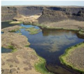
Dry Falls Lake